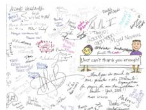
Thank you cards from Students and Teachers to the IBPO!